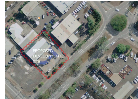
Daly St Development