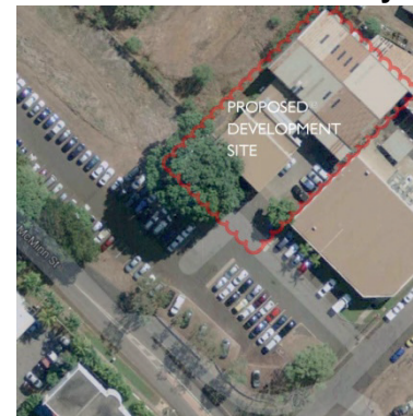
McMinn St Development